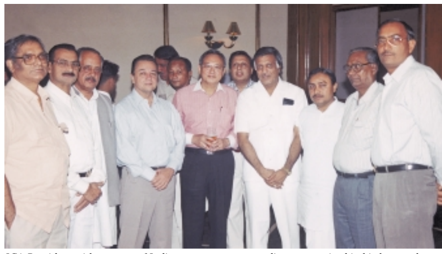
ICA President with a group of Indian co-operators at a dinner organised in his honour by IFFCO, India

The Internet allows co-operatives to improve their internal communications capacity.